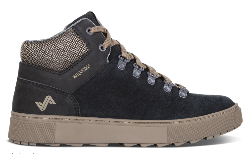
Black Multi WFW19LM9-009